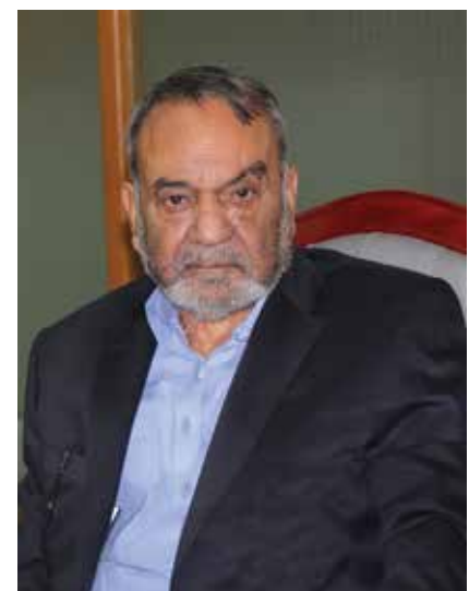
Provincial Minister LG&CD Muhammad Mansha ullah Butt chaired the Meeting

The Dashboard proved to be of great value for monitoring as more than 60,000 pictures were uploaded there in first 10 days. After successful implementation of the monitoring system, the Urban Unit has been asked to provide similar system and services for the whole project to be executed during 2018.