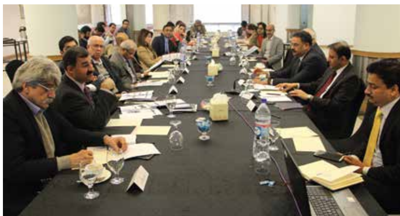
Visioning Exercise for PSS with Experts