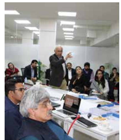
Glimpses from PSS Presentation